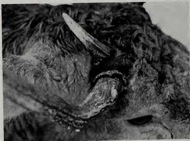
Fig. 13. Red deer stag Fernando. Picture taken on December 9th, 1966

„Ł-3“ died as a result of an accident in December 1960. His skull was prepared out (Fig. 15). The right, operated antler has no pedicle, but is placed a little further from the skull than the operated antler in fallow deer „Ł-1“. It must be assumed, that